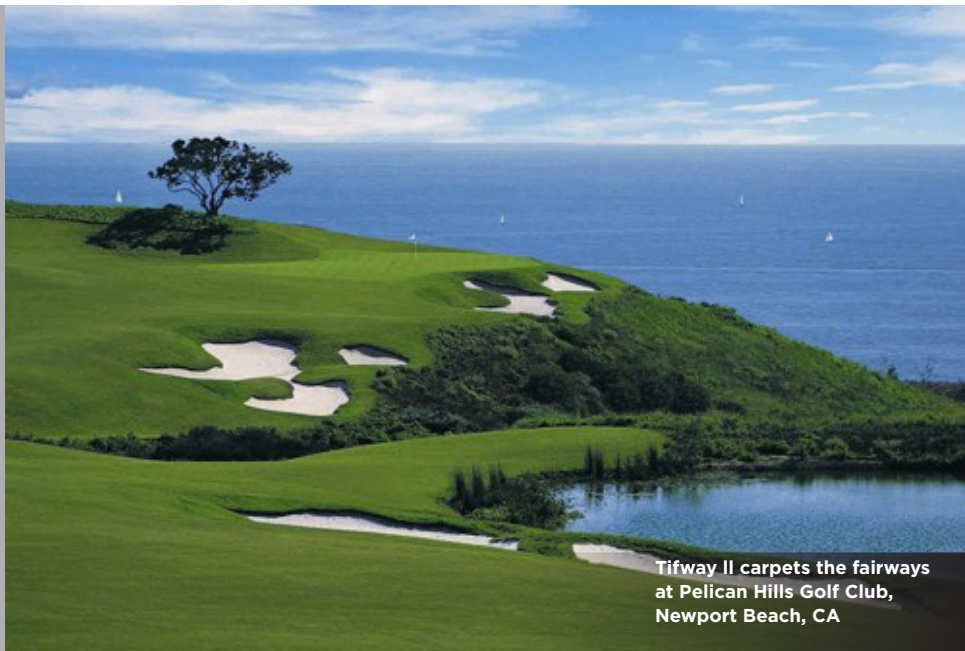
Tifway II carpets the fairways at Pelican Hills Golf Club, Newport Beach, CA

Tifway II bermuda has a shorter winter dormancy of most hybrid bermudas, staying green long into the fall and greening up early in the spring.