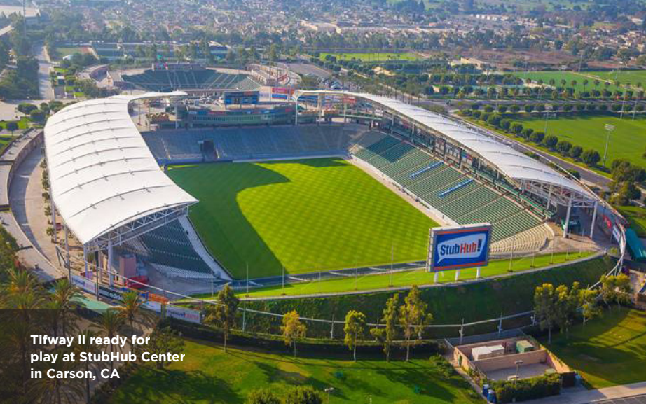
Tifway II ready for play at StubHub Center in Carson, CA