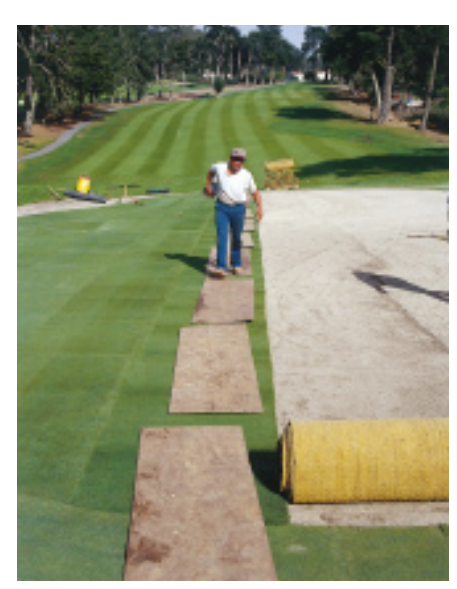
In just 10 days, West Coast Turf delivered and installed nearly three acres of its Dominant Plus bentgrass sod on the Presidio Golf Course's 18 greens. Washed big-rolls were used for fast installation and quick establishment.