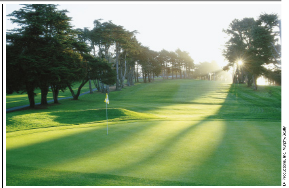
Dominant Plus creates a beautiful and high-performing putting surface on the Presidio's 11th green.

West Coast Turf Life is short. Sod it! © 2001 West Coast Turf 03/01