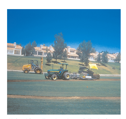
Using big-roll sod and specially designed power equipment, West Coast Turf renovated one fairway per day with minimal disruption to the surrounding community and playable areas of the golf course.