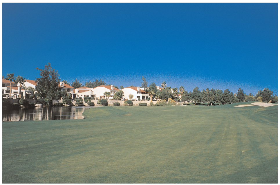
The looks and playability of Spanish Trail's fairways improved dramatically by changing to Tifway 419.

West Coast Turf Life is short. Sod it! ©2002 West Coast Turf 1/02