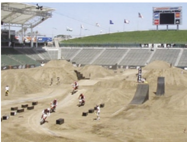
Motorcross races were held in the stadium five days before a Los Angeles Galaxy soccer game.

"Because of the extreme use we've got here, it's inevitable that we need to replace some of the grassed areas from time to time to keep it in the shape I want it to be," said Waters.